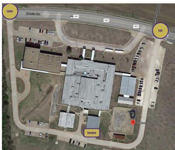
Alvarado Elementary South

Virtual learners will be able to receive meals through grab and go lines. We plan to have grab and go lines at both our Lillian Elementary campus, 5001 FM 2738, and our Alvarado Elementary South campus, 1000 E Davis. Students must be enrolled in Alvarado ISD as a virtual learner to participate in the grab and go meal program. Please see the sketch below for the flow of traffic for our grab and go lines.