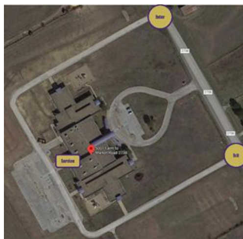
Lillian Elementary School

Meals will be served from 9-10 a.m. on Monday through Friday following the Alvarado ISD school calendar. Students will be able to receive both a