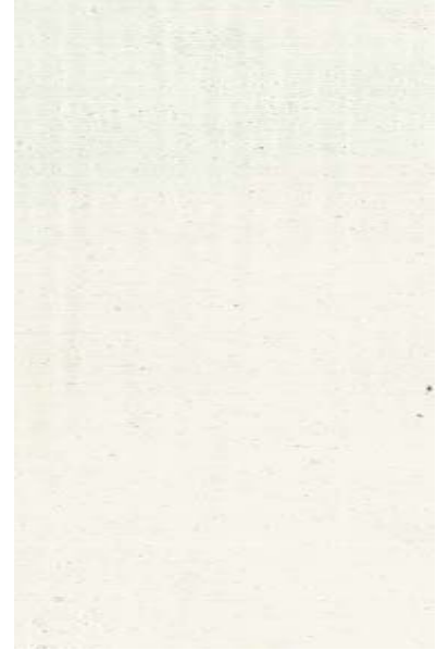
Alvarado New Linen

SHERWIN-WILLIAMS 7708 03/29/16 817-645-2381 Order# 0000000 INTERIOR PROFESSIONAL PROMAR 200 LATEX SEMI-GLOSS IFC 4010N 7068 GRIZZLE GRAY SHER-COLOR FORMULA